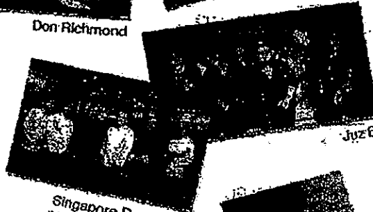
Singapore Broadway Harmonica Ensemble